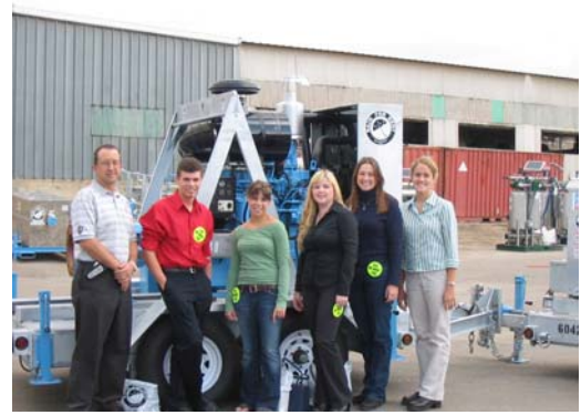
Rain for Rent Scholarship Recipients

To apply, request an Intern Application from careers@rainforrent.com and send to Rain for Rent, P.O. Box 2248, Bakersfield, CA 93303. Inquiring minds can visit our webpage www.rainforrent.com to obtain additional information about Rain for Rent's locations, products and services.