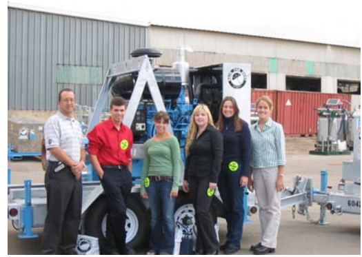
Rain for Rent Scholarship Recipients

To apply, request an Intern Application from careers@rainforrent.com and send to Rain for Rent, P.O. Box 2248, Bakersfield, CA 93303. Inquiring minds can visit our webpage www.rainforrent.com to obtain additional information about Rain for Rent's locations, products and services.