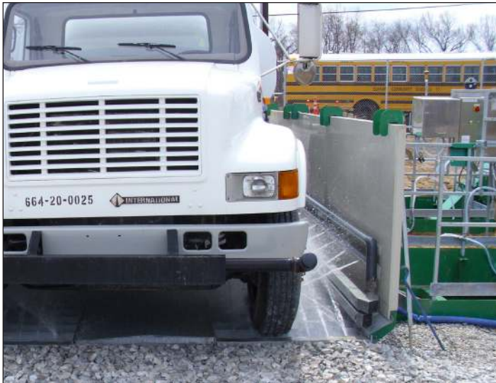
The Conline Wheel Wash System automatically starts as trucks approach the system, allowing conservation of water.