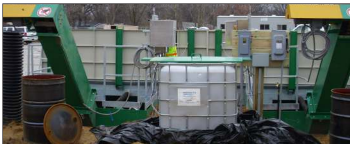
Utilizing flocculants and filtration, the Conline Wheel Wash system uses less water than manual wheel washes and provides exceptional environmental protection to remove suspended solids.

A fter years of use, a Midwestern U.S. landfill was closed and began the process of capping the land. The capping process involved hundreds of truck trips of materials brought to the site each week. These trucks posed a possible safety threat of dirt and debris on public roads, and a chance of contamination.