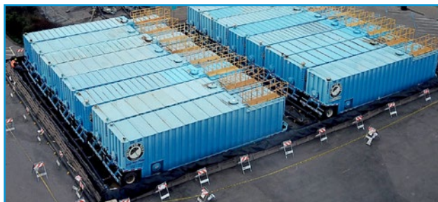
Spill Containment berms for large storage capacity with custom sizes

Rain for Rent has one of the largest fleets of frac tanks nationwide*, strategically placed to meet your storage needs. Whether you are looking for more bulk storage space, or need to clean and maintain existing infrastructure, Rain for Rent has the equipment for the job.