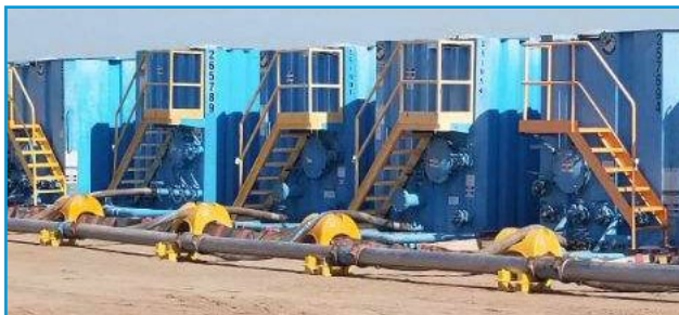
Manifold systems for bulk loading/unloading into frac tank batteries