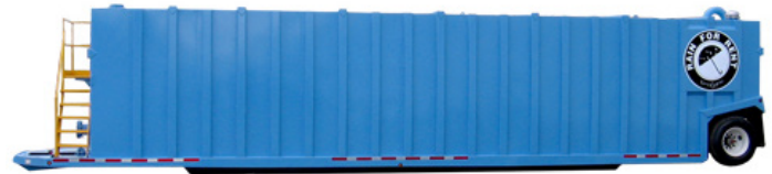
(smooth walled, flat top tank pictured)

Store liquids with confidence with Rain for Rent's NSF61 Coated water tank. Permanently attached axle, for maximum maneuverability, allows this tank to be moved with ease on the job site. The staircase ensures proper protection for workers on site. The tank also offers a solvent free, flake-filled, high performance epoxy coating designed as an internal tank lining for chemical or another commodity storage. It is suitable for use in potable water tanks/piping conforming to ANSI/NSF Standard 61 for drinking water components. It also meets AWWA C210 specification.